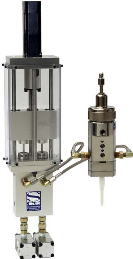
Servo-Flo 801 Meter System with 2200-545-037 Mix Dispense Valve