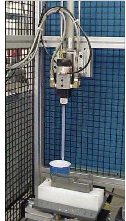
Gasketing Covers with a Remote Mounted Mix-Dispense Valve