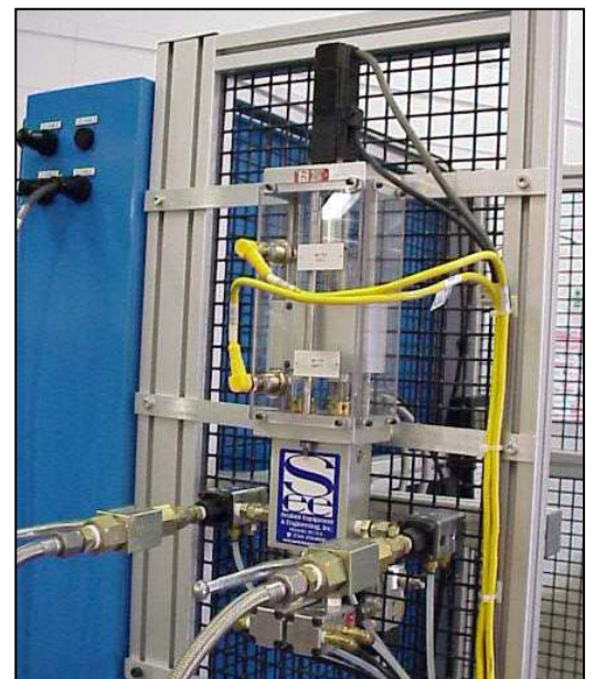
Servo-Flo 801 Meter System Mounted On Fence of XYZ Motion Dispenser