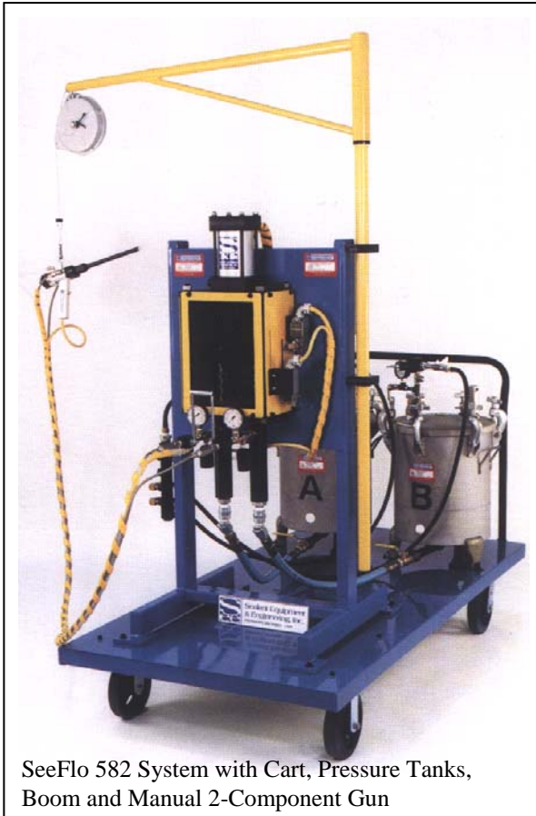
SeeFlo 582 System with Cart, Pressure Tanks, Boom and Manual 2-Component Gun