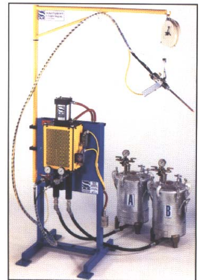
Manual System with Pressure Tanks, Floor Stand and Boom Assembly

The system is frequently used with potting or encapsulation applications, as well as filter end cap, mold making, and battery bonding.