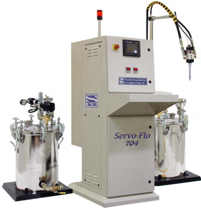
Servo-Flo 704 Gear Meter System with Pressure Tanks, Dispense Valve and Foot Pedal