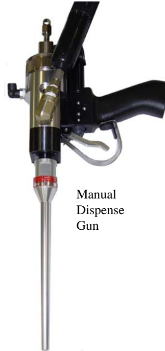
Manual Dispense Gun

Sealant Equipment & Engineering offers the widest selection of No-Drip™ and Snuf-Bak™ Mix and Dispense Valves in the industry to meet your exact dispensing requirements.