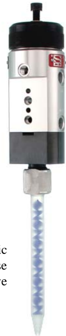
Automatic Dispense Valve